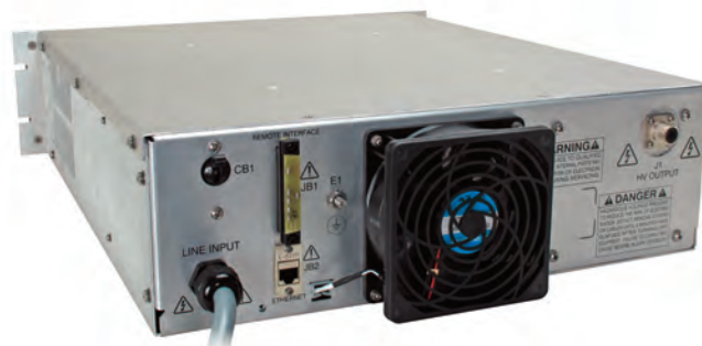
STA rear panel shown with local operation plug installed in 50 pin D connector

*Substitute "P" for positive polarity and "N" for negative polarity. Polarity must be specified at time of order.