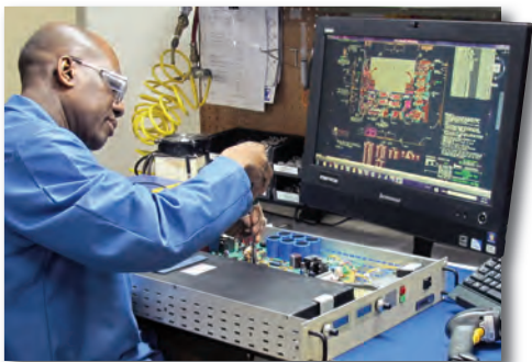
Repairs are made by qualified technicians using OEM parts

In our Preventative Maintenance (PM) Programs we replace “consumable” or “time-dependent” components, provide full factory test, calibration and burn-in, restoring the product to original factory specifications. On top of that, we add an inclusive warranty to protect your investment. PM is a great way to extend the life of your Spellman product, at a fraction of the cost of a new power supply or X-Ray source. Spellman certified upgrades can also be provided at a reduced cost.